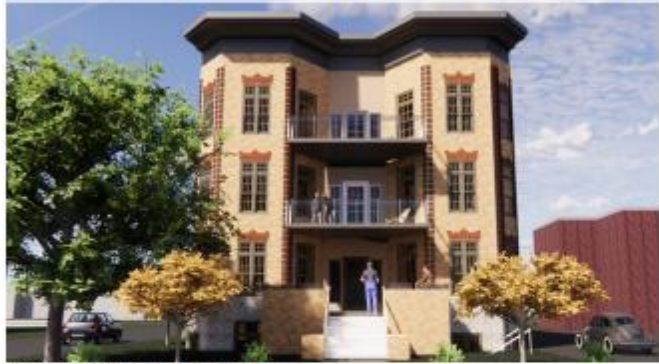
South Facade of 628 E Franklin