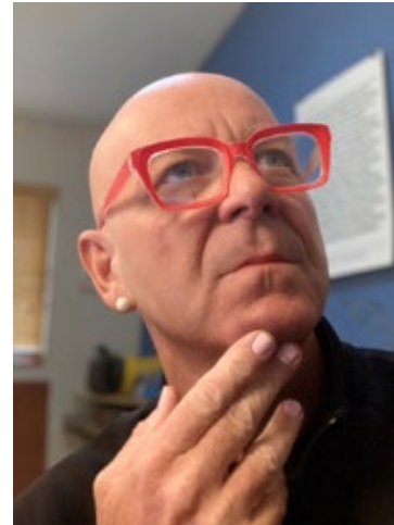
Damon Barda C/A ARCHITECTS Long Beach, CA