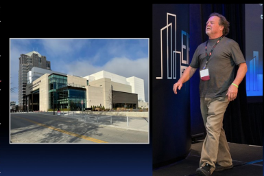
2021 EIFS AWARD OF MERIT

Wayne Spencer Contracting Contractor Carolina Specialties, Inc. Distributor ParexUSA Manufacturer City Of Greensboro, NC Owner/Developer H3 Collaboration Architecture, LLC Architect