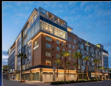
2021 EIFS HERO AWARD