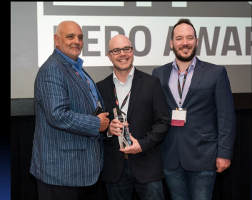
2021 EIFS AWARD OF MERIT

Reitter Stucco and Supply Contractor Reitter Stucco and Supply Distributor ParexUSA Manufacturer Adena Regional Medical Owner/Developer M & A Architects Architect