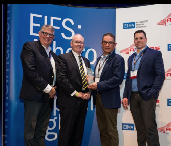
2021 EIFS AWARD OF MERIT

Great Lakes Prefabrication, in partnership with Grayhawk, LLC Contractor L&W Supply Distributor Sto Corp. Manufacturer Community Health Systems Owner/Developer Gresham Smith Architect