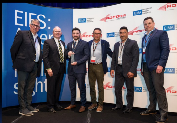
2021 EIFS AWARD OF MERIT

Elite Wall Systems Contractor Sto of N.J. Inc. Distributor Sto Corp. Manufacturer Harrison Central School District Owner/Developer H2M Architect