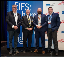
2021 EIFS AWARD OF MERIT

Premier Exteriors Contractor Master Wall, Inc. Manufacturer Regent Partners Owner/Developer Smallwood, Reynolds, Stewart, Stewart and Associates, Inc. Architect