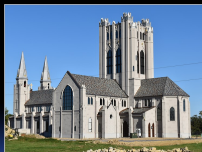
2021 EIFS HERO AWARD