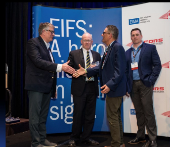
2021 EIFS AWARD OF MERIT

Southern Wall Systems Contractor Capitol Materials Distributor Sto Corp. Manufacturer CA Ventures Owner/Developer Solomon Cordwell Buenz Architect