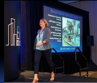
2021 EIFS AWARD OF MERIT

Performance Contracting Contractor L&W Supply, Las Vegas Distributor Dryvit Systems, Inc. Manufacturer Resort World Las Vegas Owner/Developer Steelman Partners, LLP Architect