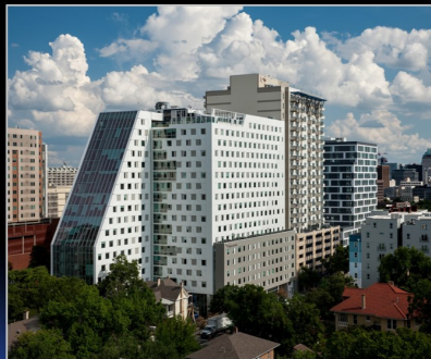
2021 EIFS HERO OF THE YEAR