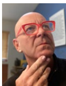
Damon Barda c|a ARCHITECTS Long Beach, CA